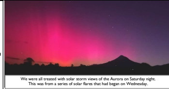
We were all treated with solar storm views of the Aurora on Saturday night. This was from a series of solar flares that had begun on Wednesday.

Moa Mail is a free fortnightly publication delivered to all households in the Ingwood District. Printed by The Ingwood Development Trust Office 25 Rata Street (Ingwood Information Centre) Circulation 2800 The Moa Mail can be viewed on the web at www.ingwood.co.nz and on Facebook News and Advertising Office Phone 06 756 7039 Email moamail@info.com Office Hours Mon-Fri 10.00am - 4.00pm Sat-Sun 10.00am - 2.00pm Points and views expressed are not necessarily the views of The Ingwood Development Trust