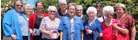
Above: Ladies Christmas Lunch