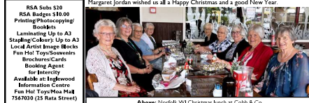
Above: Norfolk WI Christmas lunch at Cobb & Co