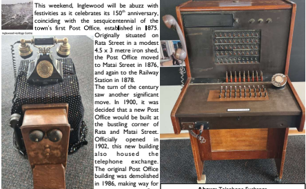
Above: Try sticking this phone in your pocket! Below: Telephone Exchange